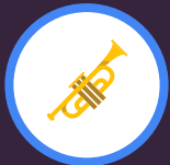
AGNES POWELL BUTTERSMITH THE GIRL GUIDES