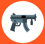
VICTOR GORJESKIE THE RUSSIAN MAFIA

I am a Russian oil magnate. My company 'Filthy Stinking Rich' Incorporated has more oil reserves than the Middle East. People ask me, is being so rich hard? Can it really buy you happiness? Well the answer is very simple – yes, yes it can.