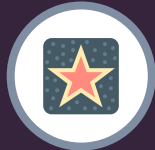
BAZZA ERSKINEVILLE THE LEADING MAN (MOVIE CAST AND CREW)