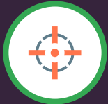
GRASSY KNOLL THE EX-ASSASSIN